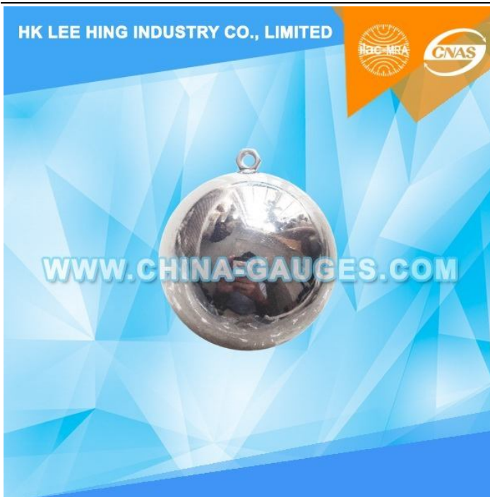
EN IEC 60950 Figure 4A / EN IEC 60065 Figure 8 - 50mm Impact Test Steel Ball with Ring